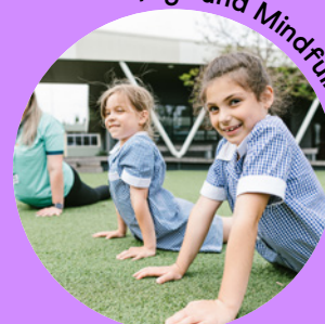
Yoga and Mindfulness