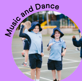
Music and Dance

In any one week, children could be participating in science experiments, active play, creative expression and more - we believe in learning through experience so that each child can grow into who they want to be.